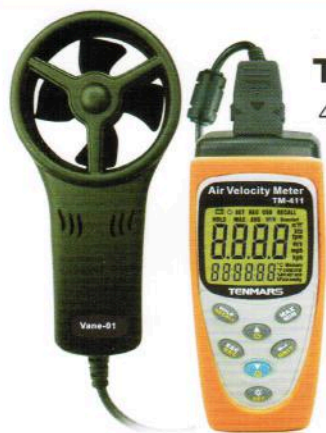
TM-411 ~ 414 45mm 4 plastics vane.