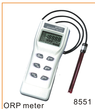
ORP meter 8551