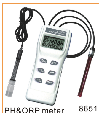
PH&ORP meter 8651