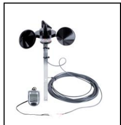
Pole Mount (any length wire)