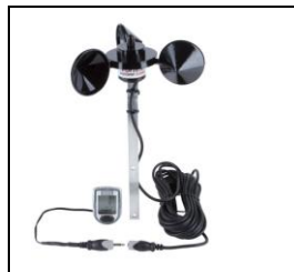
"Flex Wire" (only 25 feet)