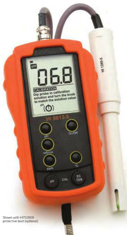
Shown with HI710008 protective boot (optional)