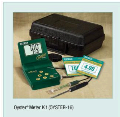
Oyster® Meter Kit (OYSTER-16)