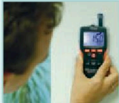
Measure moisture of wall material with non-invasive Pinless technology