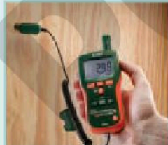
Pin Moisture Probe included for making contact moisture measurements