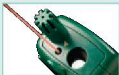
Patented IR thermometer design locates cold spots on walls, which identifies surfaces subject to condensation (direct differential display of IR - DP)